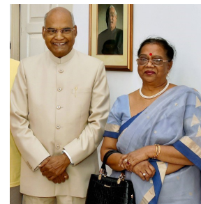
President with his First Lady (Wife)

PM congratulated President after the oath and said very inspiring message given by our President who has beautifully summed up the essence of India’s strength, democracy and diversity.