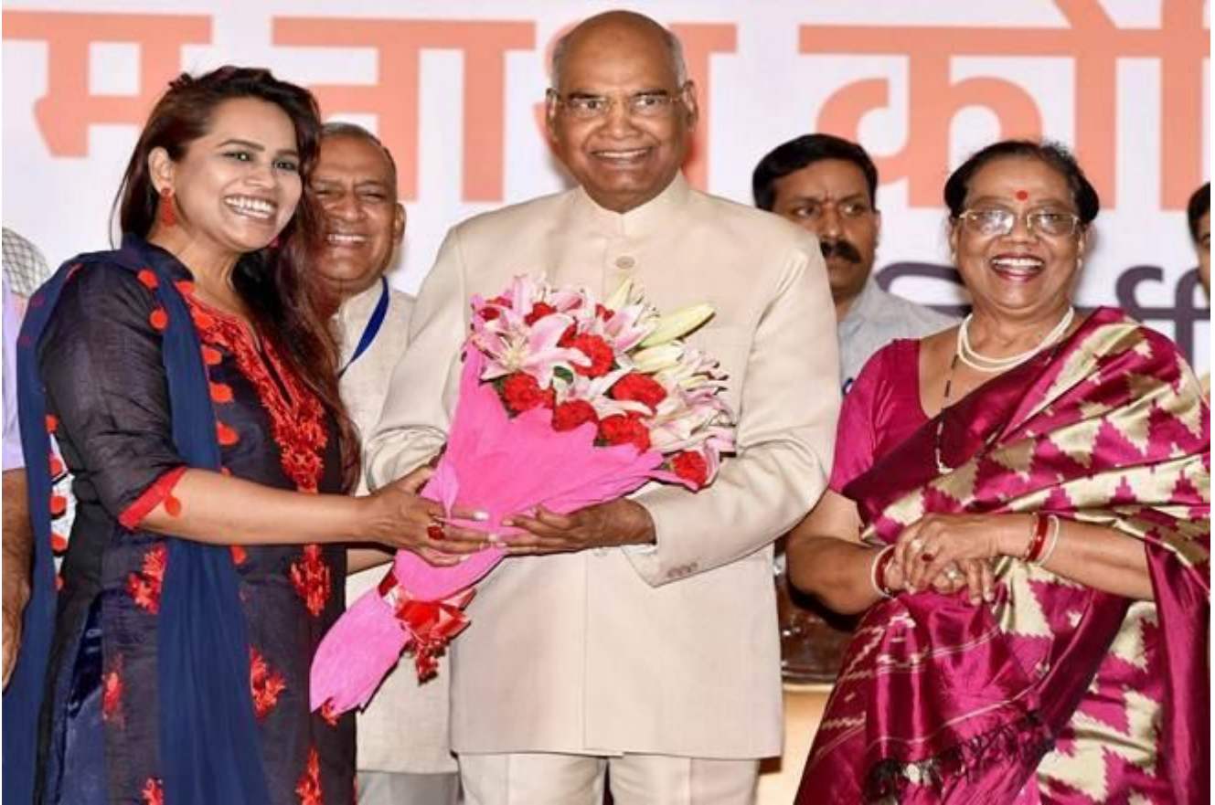
HONORABLE SHRI PRANAB MUKHEJEE WITH ELECTED 14 th PRESIDENT HONORABLE SHRI RAMNATH KOVIND

Honorable Shri Pranab Mukherjee was congratulated and extended a warm welcome to Shri RamNath Kovind and wished him success and happiness in the years to come.